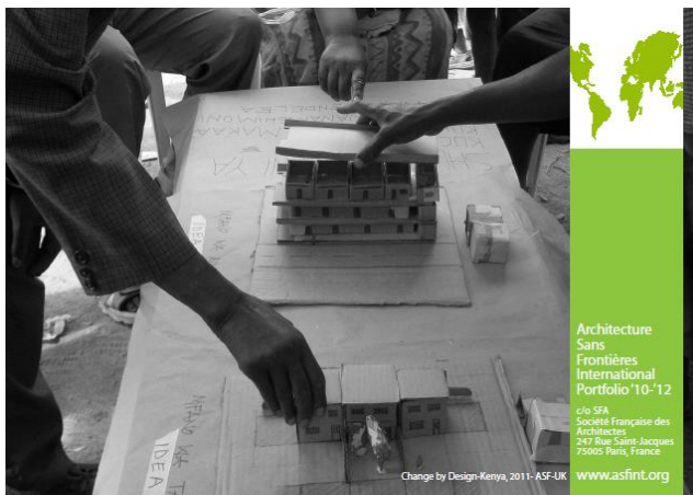
Cover of the PowerPoint presentation.

One positive results of the establishment of the Secretariat is the regular publication of the newsletter, which was started at the GA meeting in April and has resulted in the publication of three issues during 2012. The responsibility to edit the newsletter rotates between Board members, assisted by the Secretariat, which also edits and makes the layout. The Secretariat has retrieved the existing list of subscribers (more than 300) and sent the newsletter to several hundreds of people, including the Leonardo group, and all those who have shown an interest in ASF. It remains to see how individual members of member organisations can get the newsletter.